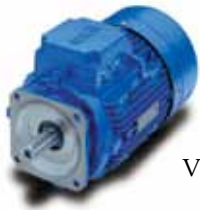
Vector Duty AC