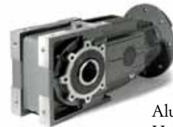
Aluminum Helical Bevel